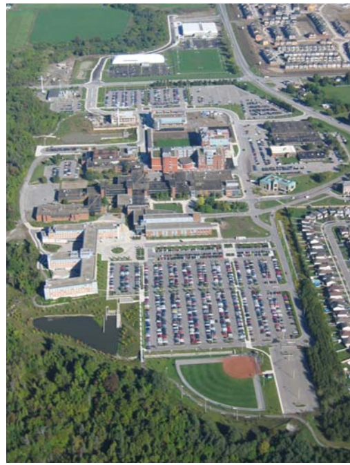
Durham College, UOIT, Tennis Courts & Arenas - 2006