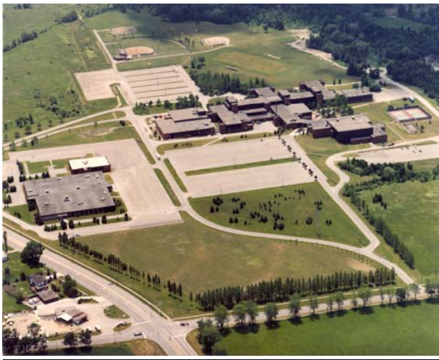
Willey Bldg., Simcoe Bldg., H Wing, D Wing & Athletics Complex