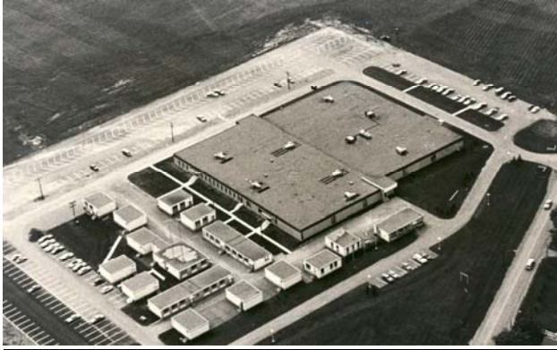
Simcoe Bldg. + Portables