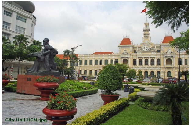
City Hall HCM.jpg