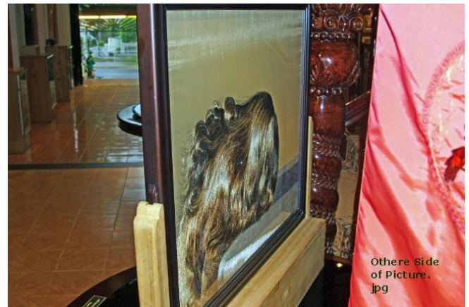
Other Side of Picture