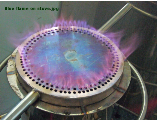
Blue flame on stove