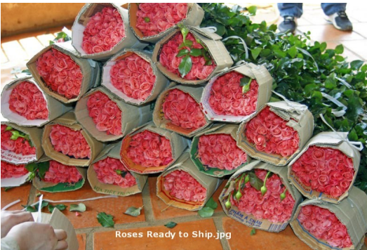
Roses Ready to Ship