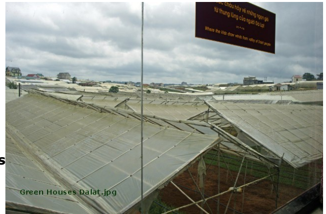
Green Houses Dalat