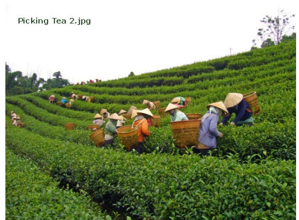
Picking Tea 2.jpg